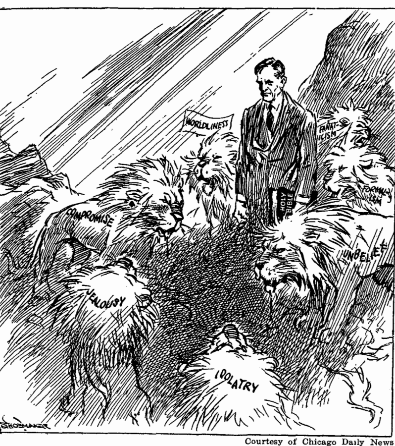
Today's Christian in the Den of Lions

Tew who has prospered despite the persecution is typical of spiritual Israel. The same persecution follows spiritual Israel for she is a race without a country, without an abiding place; without a city for seeks a city whose builder and maker is God. Just as the nations of the earth despise the Jew today so does the world despise the man who is true to God. If we were more faithful to Jesus we would have more per-